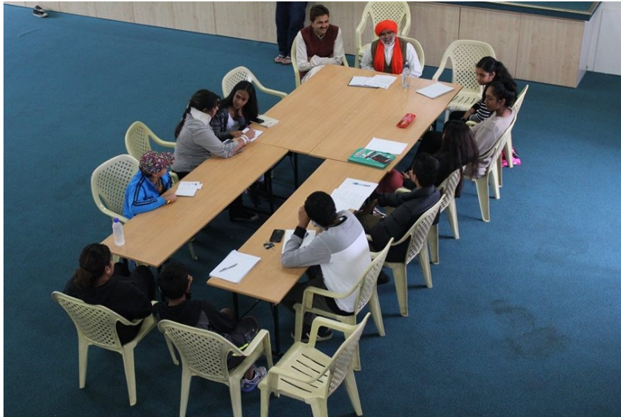
New Zealand Youths participating in the Youth training sessions