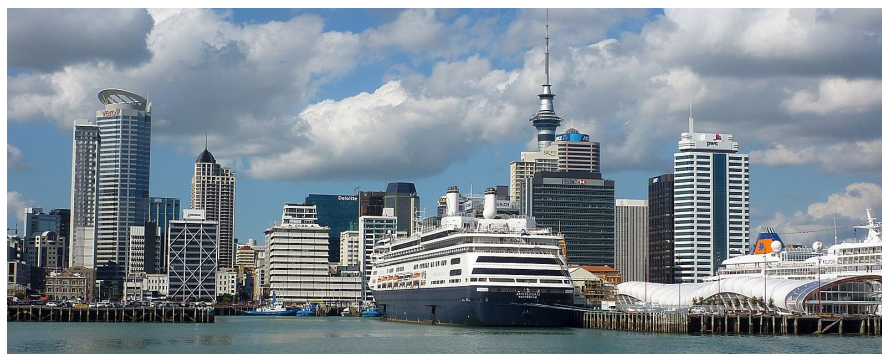
Auckland, The City of Sails is the host city for the Sammellan