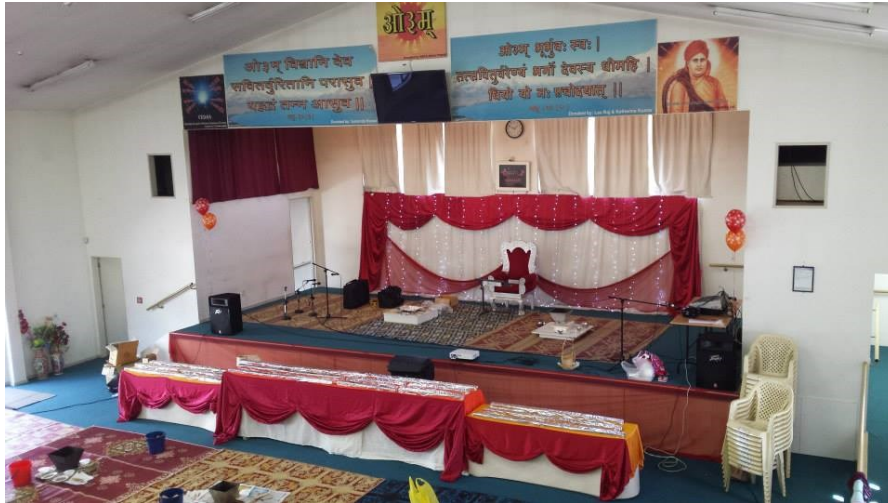
The Vedic Centre in Papatoetoe, Auckland is the venue for the Pacific Mahasammellan