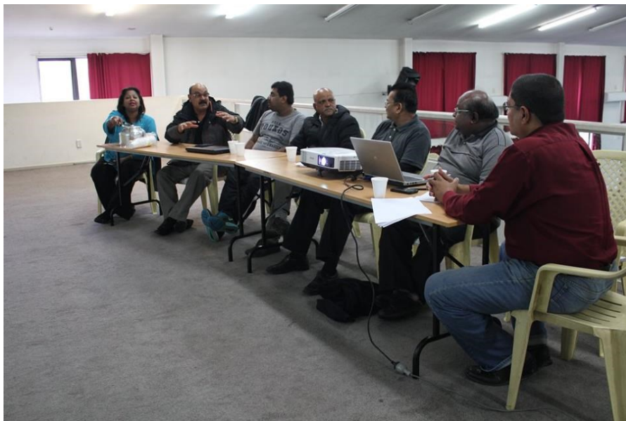
Executives at one of the many meetings of the Organising Committee